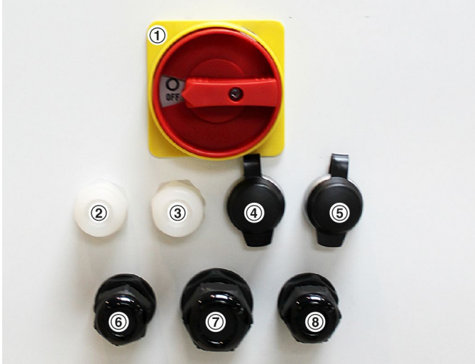
Fig. 2: Cable entry points below the mains isolator